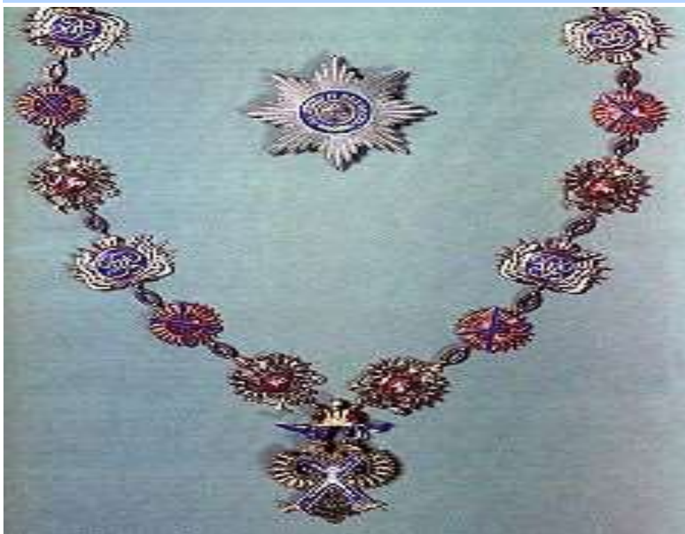
sign on order chain and star of the order